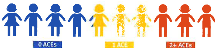
Children 0-17 years of age in Arizona

When it comes to legislation, Arizona-specific ACEs data will provide a powerful new tool for